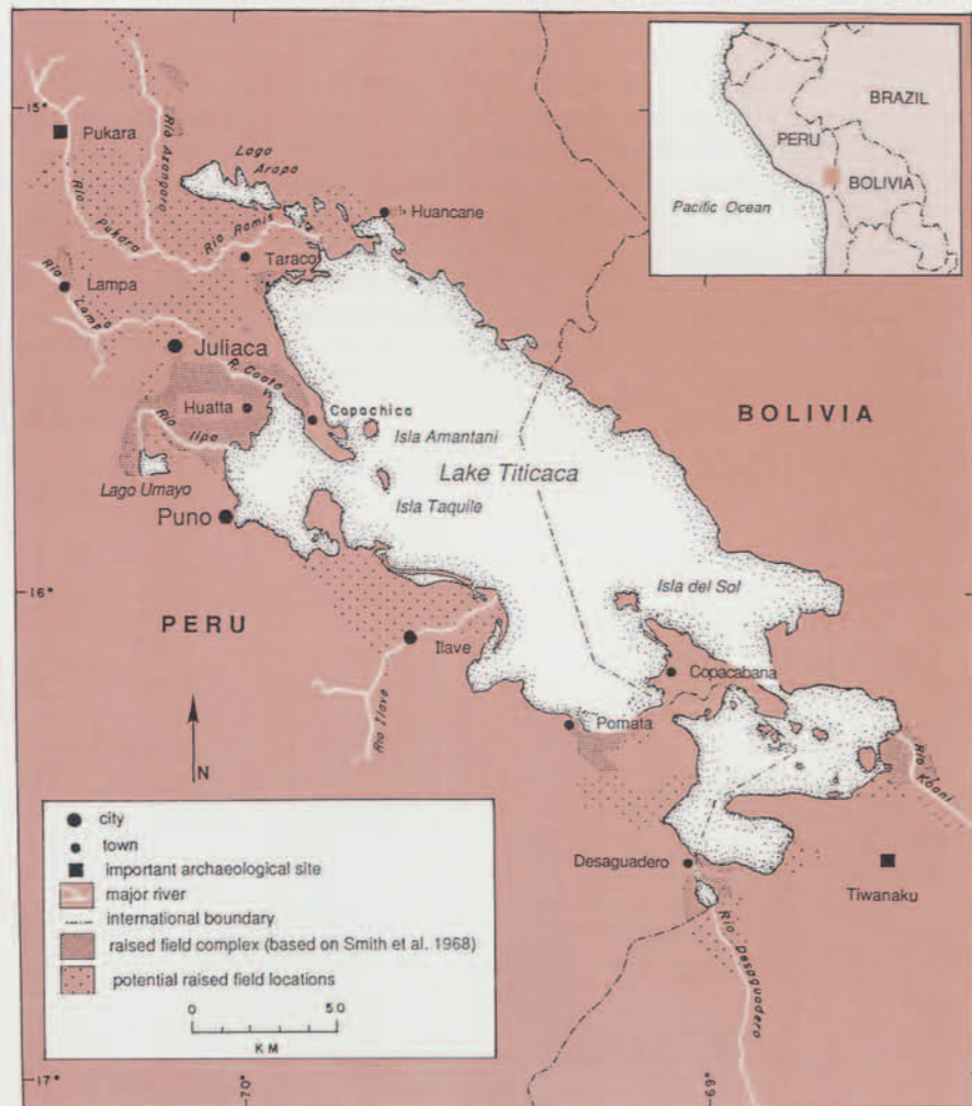
1 Map showing distribution of raised field remains (based on Smith et al. 1968; fig. 1) and potential raised field sites within the Lake Titicaca basin of southern Peru and northern Bolivia.

fields had probably been abandoned before the arrival of the Spanish. Questions such as who constructed the fields, when were they built, what crops were cultivated, why the fields varied so