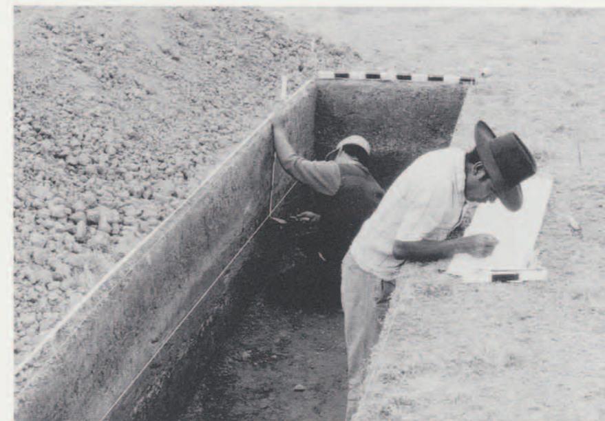
4 Archaeological excavations in raised fields provided the archaeologists and agronomists with specific data on original field form, building stages, use period and abandonment, and samples of soil, pollen, and artifacts. Here, soil stratigraphy is being mapped by archaeological crew members. These stratigraphic profiles of prehistoric fields provided the models for proper reconstruction in the experiments.

Soil analysis indicates that the canal sediment, composed primarily of organic matter, is rich in nutrients, much more so than the average pampa soil. In addition, soil alkalinity, a major constraint on agriculture in the lake edge soil, is markedly lower in the canal sediments. These rich sediments were periodically removed from the canals and added to the raised fields to improve the crop soils. Pollen samples from these excavations have been analyzed by Dr. Fred Wiseman of the Massachusetts Institute of Technology. He finds that pollen grains of quinoa and potato are present in many soil samples from the raised fields, indicating that these may have been the crops grown on the fields. Unfortunately,