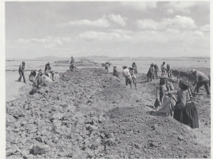
9 Community lands are cultivated today by representatives from each family household, an old Andean pattern of communal labor. Here, the final construction of a large raised field platform of the Community of Yasin in Chojñocoto, Huatta. Loose soil is tossed on the field using carrying cloths to create a convex surface over the sod blocks which make up the fill (September 1985).

A more effective approach to development is through what is referred to as "appropriate tech-