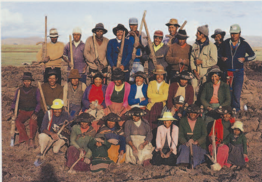
10 Quechua farmers of Yasin, Huatta, holding traditional Andean tools: the rawkana or hoe (woman second from left in front row), the waqtana or clod breaker (woman at right end of first row), and the chakitaqlla or footplow (men in back row). After several years of successful harvests, many community groups and individual families in the region collaborated with the project, donating the use of communal land and their labor in return for potato seed and the subsequent harvest from the experimental fields (October 1982).

Not only can the Quechua- and Aymara-speaking peoples take great pride in the sophisticated agricultural technology of their ancestors, but they can actually apply it to solve some of the contemporary economic and agricultural problems of Peru and Bolivia. The farmers of the communities participating in rehabilitating raised fields are taking that step. The high productivity of raised field technology not only helps to support the growing populations of the towns and cities of the region where many small farmers have had to migrate in search of a livelihood, but also helps us to understand and preserve this technology for the future. It is ironic that such an immensely important and productive technology is being destroyed in many areas around Lake Titicaca by modern plow farming, urbanization, and road-building. 2