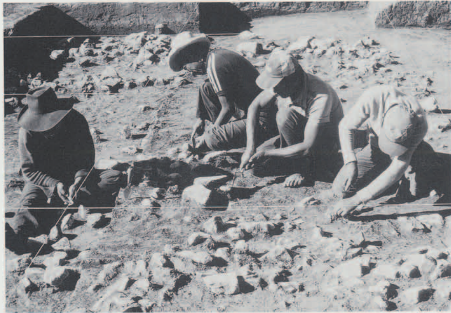
5 Excavations in habitation mounds provided an excellent context for documenting the lifeways of prehistoric farmers. The archaeological crew is exposing a floor and foundation of a house of the Pucara culture at the site of Pancha. From this floor, the archaeologist recovered cooking and serving vessels, food remains, and agricultural implements used to construct raised fields.

the field stratigraphy, but the duration of each phase could not be ascertained through stratigraphic analysis alone. Carbonized remains for radiocarbon dating were not present in raised fields, but six pottery samples recovered from stratigraphic contexts in both the construction fill and the canals could be dated by the thermoluminescence technique. This technique determines the time elapsed since the original firing or last exposure to fire of the ceramic vessel. These dates give us a secure chronology for the raised fields and correlate nicely with the dates from the occupation mounds. The surprisingly early dates between 1000 B.C. and the beginning of our era, and the successive building stages and abandonment periods, demonstrate that the raised field system was not a brief late phenomenon as previously suspected. It appears to have been a relatively early agricultural development which was expanded gradually and was used by many generations of Andean farmers.