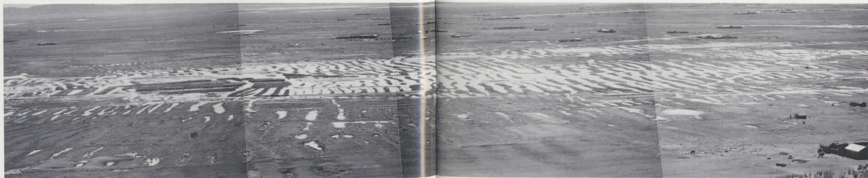
3 A panorama of ancient raised field remains of the Viscachani Pampa belonging to the residents of Collana Segunda, Huatta, Peru, shows only a small portion of the 82,000 hectares of ancient raised fields in the Lake Titicaca Basin. The lighter surfaces are water-filled canals and the darker surfaces are raised fields or drier pampa. The project's reconstructed raised fields are located in the left center of the photograph (May 1986).

raised fields: large elevated planting platforms with intervening water-filled canals designed to improve drainage, maximize soil fertility, prevent frosts, and/or provide irrigation