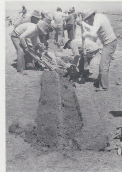
6 (above) Members of the Community of Segunda Collana using footplows to cut sod blocks from old canals for the retaining walls for rebuilding the raised field platforms in Viscachani Pampa, Huatta (October 1985).

anean courtyards (see K. Chávez, this issue). Tiahuanaco (A.D. 300-1000), one of the most impressive Andean sites, probably had its humble beginnings at this time and rapidly grew to influence most of southern Peru and the Bolivian highlands by A.D. 500 through its control of long-distance trade, its colonies, and religious missionization (Browman 1978). Tiahuanaco subsequently collapsed and was replaced by several competing Aymara kingdoms around A.D. 1000. These in turn were conquered by the Inca empire around A.D. 1450. Earlier hypotheses suggested that construction of raised fields and terracing was related to the later cultures, when population stress resulted in the development of labor-intensive agricultural technology, and a centralized bureaucracy was available to plan, direct, and manage the agricultural systems (Smith et al. 1968; Kolata 1986).